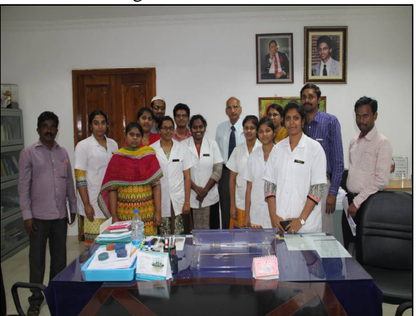
Team of Doctors with Director, Director (Infra) and NSS Programme Officer