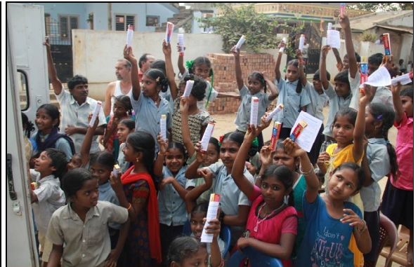
Doctor's verifying the patients and MPUP School Children's showing the dental kits